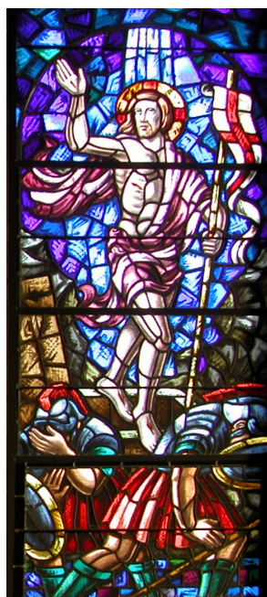
Resurrection of Jesus, Stained Glass Window in Church